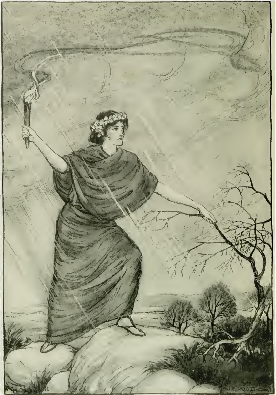
It never was extinguished by the rain or wind